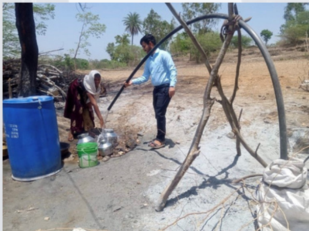
One of the 6 Water Bore wells funded by our Ministry