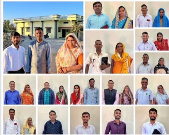
Ordained Pastors of Rajasthan Church