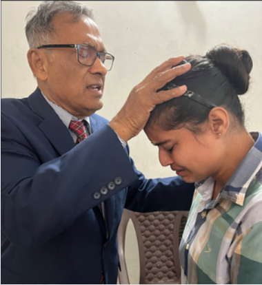
This Girl received healing from Typhoid infection that wasn't healing for a long time