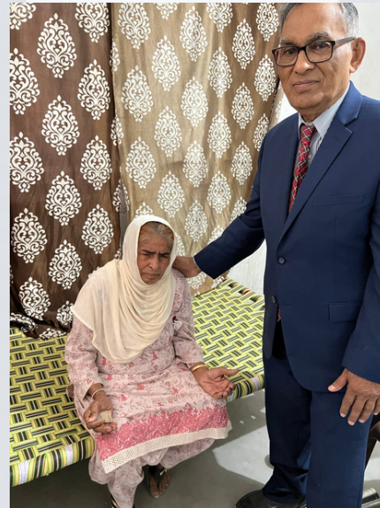
Lady with Rs 100 note (in here right hand which she was giving me) accepted the Lord. She had never heard about Christ. She was in hopelessness and emotional distress.