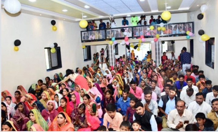
Inaugural service of new Church on new years