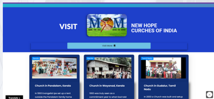
The stories of New Hope Churches of India