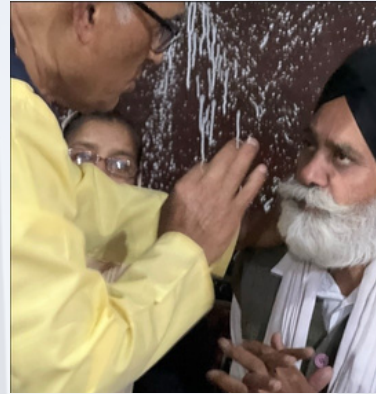
This Elder had stiff arms and legs and was unable to walk and had no mobility. He was able to move his hands and legs after prayer.