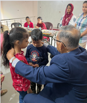
This little 4-year-old was always angry and was beating his sister. The boy was aggressive after his Father passed in an unfortunate accident. He received deliverance from rage.