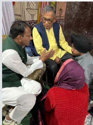
This Young man's wife worked in a middle-east country. Recently she had not been communicating or calling him. He was emotionally disturbed. After prayer he had a call with his wife and expressed his love for her. There was reconciliation through Christ